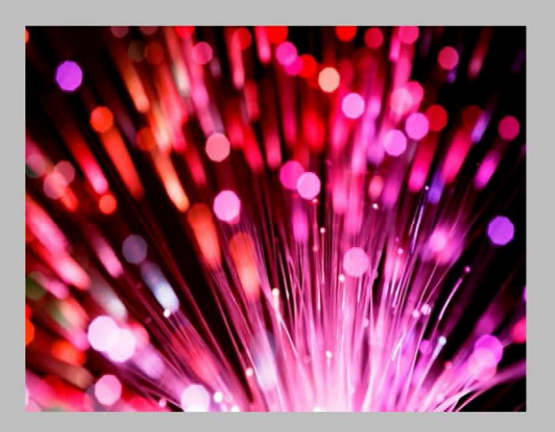
Table Decorations graciously donated by SNF Holding Company