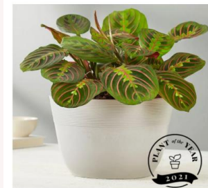
Shop now: Red Maranta Prayer Plant ($55)