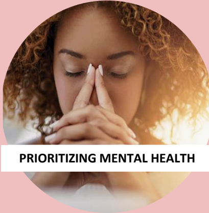
PRIORITIZING MENTAL HEALTH