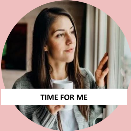
TIME FOR ME