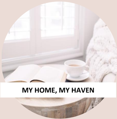
MY HOME, MY HAVEN